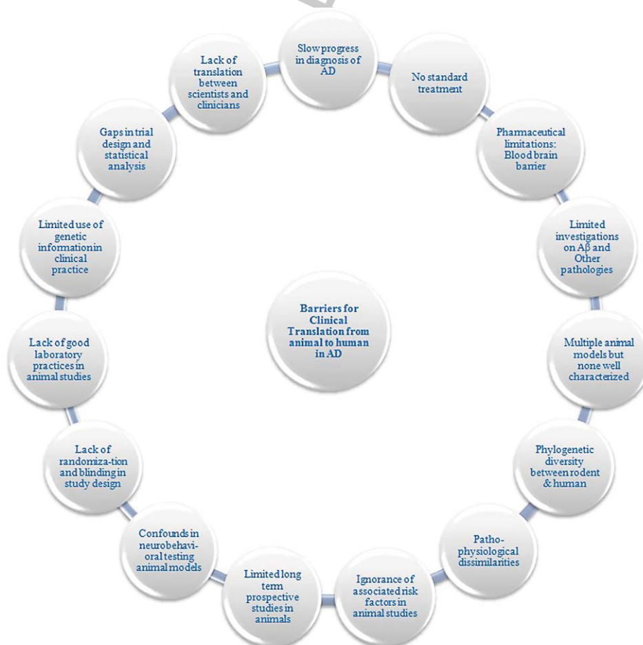
Fig. 2. Road blocks in the translation of preclinical outcomes in Alzheimer's disease (AD) from animal to human.

Discovery of successful new drugs for clinical benefit of AD requires stringent analysis for safety and efficacy in suitable animal and cell-culture models. Over the last three decades, several animal models of AD have been developed to understand disease mechanisms and identify therapeutic targets, as well as screen novel drugs derived from synthetic chemistry and/or traditional herbal formulations [25]. Based upon different theories, multiple approaches have been used